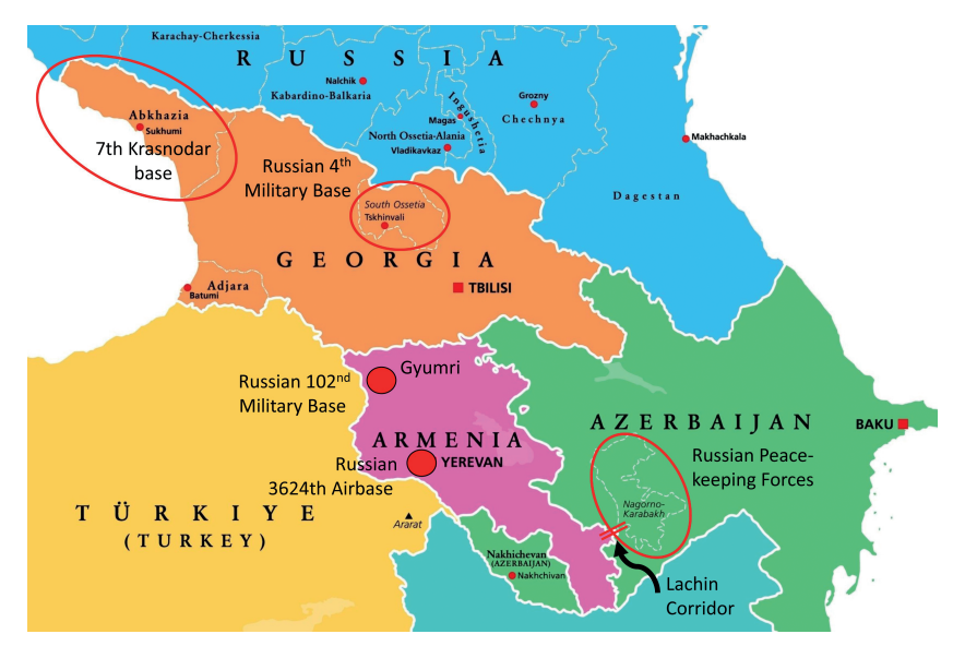
Fig. 2: Russian Armed Forces in the South Caucasus (until 2023)

1991, Russia also successfully managed to strengthen its influence over the South Caucasus, a region which was called Moscow's "zone of privileged interests" (Huseynov 2021, 30). In the whole region Russia was an indispensable actor for decades. Before invading Ukraine, Russia had been the main mediator between Azerbaijan and Armenia in the Nagorno-Karabakh conflict. But Russia could also be seen as a "patron and protector for separatist regions within the internationally recognised borders of Georgia and Azerbaijan" (Ambrosetti 2022, 5). In this way, Russia was able to cynically maintain frozen conflicts to preserve its regional hegemony. This strategy can be called divida et impera: divide and rule!