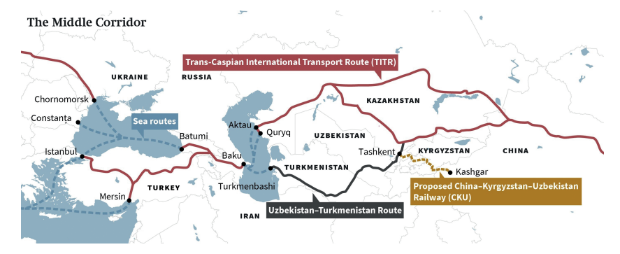
Fig.3: The Middle Corridor of BRI