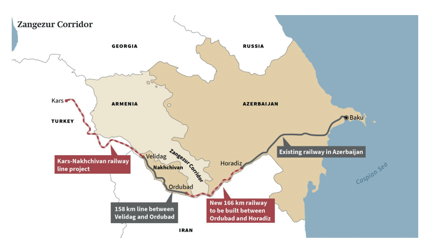
Fig. 4: Zangezur Corridor in the South Caucasus

2024 Azerbaijan has agreed to withdraw the demand for a Zangezur Corridor through southern Armenia from a peace agreement with the country (Barseghyan and Farhadova 2024).